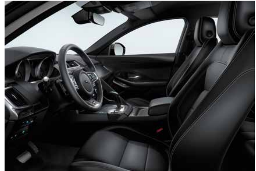
INTERIOR SHOWN: Ebony/Ebony interior with Light Oyster Stitch, Ebony Grained Leather Sport Seats with Ebony Headlining. 300HG Available on E-PACE R-Dynamic S / SE.