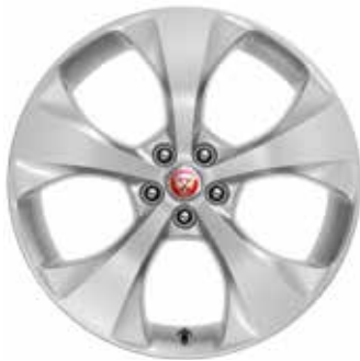
20" 5 SPOKE 'STYLE 5054'