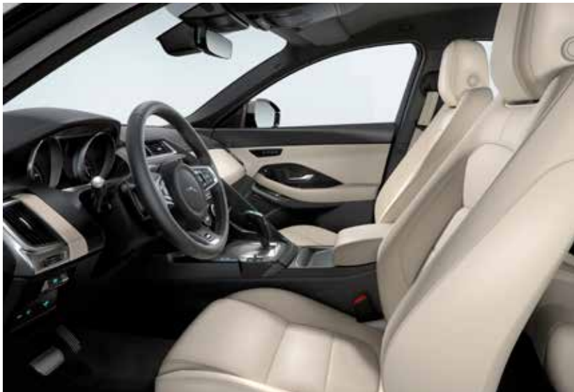
INTERIOR SHOWN: Ebony/Light Oyster interior with Light Oyster Stitch, Light Oyster Grained Leather Sport Seats with Ebony Headlining. 300HM Available on E-PACE R-Dynamic S / SE.