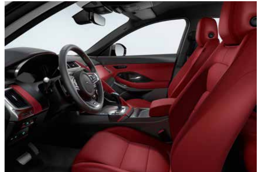
INTERIOR SHOWN: Ebony/Mars Red interior with Mars Red Stitch, Windsor Leather Sport Seats with Ebony Headlining. 300HN Available on E-PACE R-Dynamic S / SE.