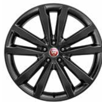
20" 5 SPLIT-SPOKE 'STYLE 5051' WITH GLOSS BLACK FINISH