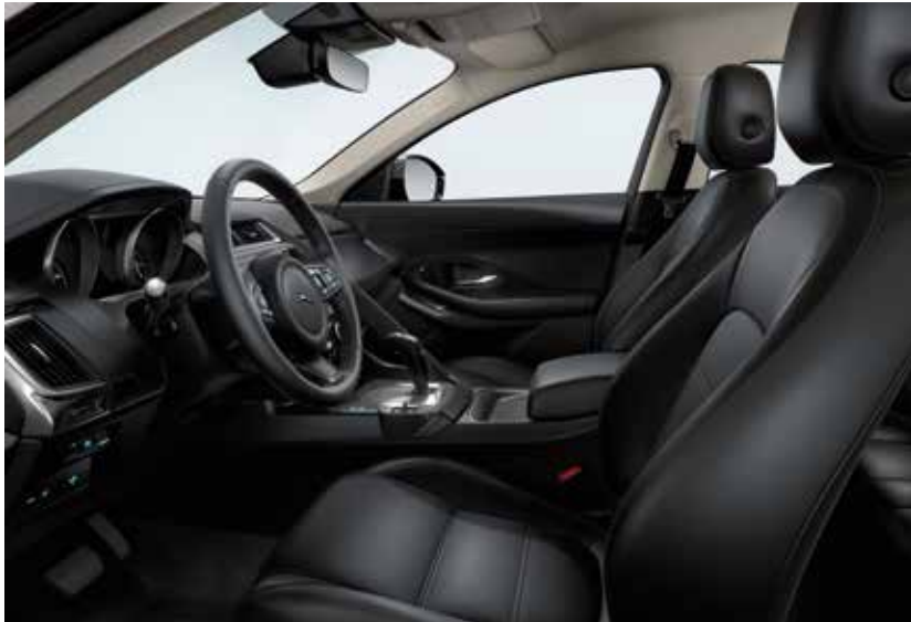
INTERIOR SHOWN: Ebony/Ebony interior with Ebony Stitch, Ebony Grained Leather Sport Seats with Light Oyster Headlining. 300HC Available on E-PACE S.