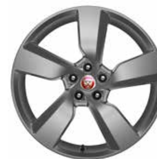
19" 5 SPOKE 'STYLE 5049' WITH SATIN DARK GREY FINISH