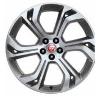
20" 6 SPLIT-SPOKE 'STYLE 6014' WITH SATIN GREY DIAMOND TURNED FINISH