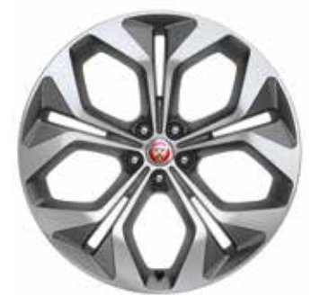
21" 5 SPLIT-SPOKE 'STYLE 5053' WITH SATIN GREY DIAMOND TURNED FINISH