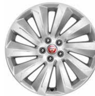
19" 10 SPOKE 'STYLE 1039'