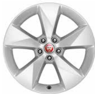
18" 5 SPOKE 'STYLE 5048'