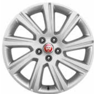
18" 9 SPOKE 'STYLE 9008'