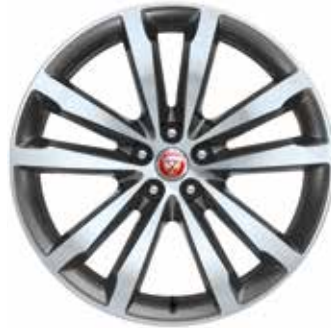
20" 5 SPLIT-SPOKE 'STYLE 5051' WITH SATIN GREY DIAMOND TURNED FINISH