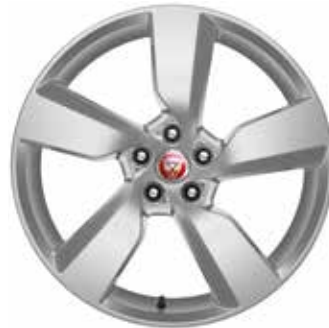
19" 5 SPOKE 'STYLE 5049'